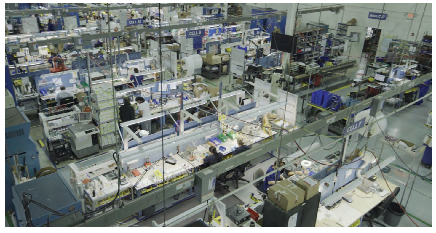
With the right strategy and planning, lean can be used in job shops that have a high-mix of products at relatively lower volumes.

Beginning in 2008, we have applied lean to our manufacturing operation, and it is now a pervasive force in improving the efficiency of our factory. Lean provides our customers with several benefits, including gains in safety, quality, productivity and capacity. In this paper, we'll dig into those benefits, as well as the lessons we learned by applying lean in a job shop environment.